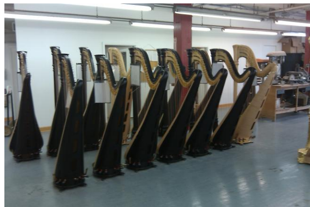
Harps awaiting regulation at the Lyon & Healy factory, Chicago

In March, I visited my old hometown of Chicago, to attend the Lyon & Healy/ Salvi Technicians Guild's Conference for Regulators at the Lyon & Healy factory in Chicago. This biennial event brought harp technicians from the US, Europe, and Asia together for a two-day festival of learning and sharing. Technicians from Lyon & Healy and Salvi were on hand to fill us in on the latest