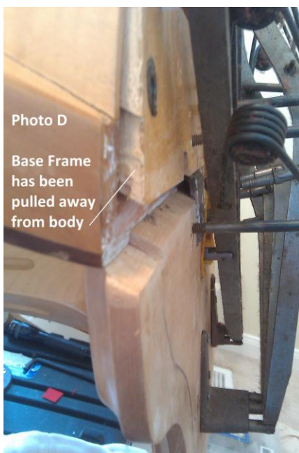
Photo D shows what can eventually happen if this situation is not corrected. Here, the baseboard has been pulled way out of alignment with the body, and it has dragged the base frame along with it. This harp's regulation is likely to be severely compromised. In addition, it will be off balance, and will tend to tip backwards much more easily than it should, leaving it open to further injury.

It is advisable not to let your harp get to this point. Once things get this bad, the forces that are no longer being contained by the failed base frame will be redistributed throughout the harp, causing warpage and bending in the neck and column. Even if you repair the base frame eventually, the other parts may be permanently misaligned, and the harp will never quite play the way it should. Generally, I encourage people to start preparing financially for a frame repair if the baseboard has traveled more than three eighths of an inch, and to send the harp to the repair